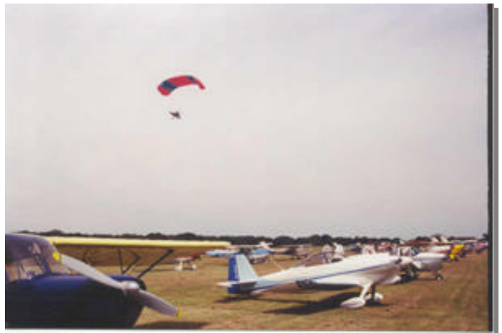
USUA Club 497- Ultralight Flying Objects Of Central Texas Planes in the air and on the ground.

For more information about the club, visit their website www.ufosofcentraltexas.com .